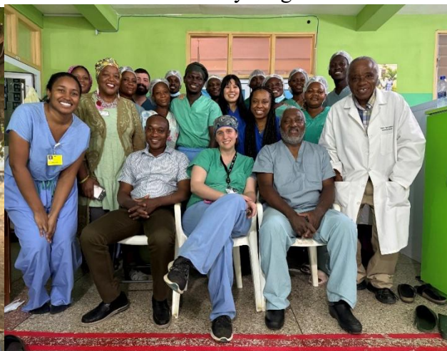
US Surgeons with the Ghanaian Surgical Team