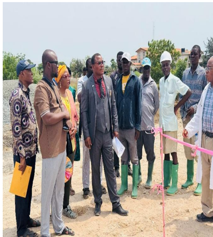
Dedicated Construction team since 1997