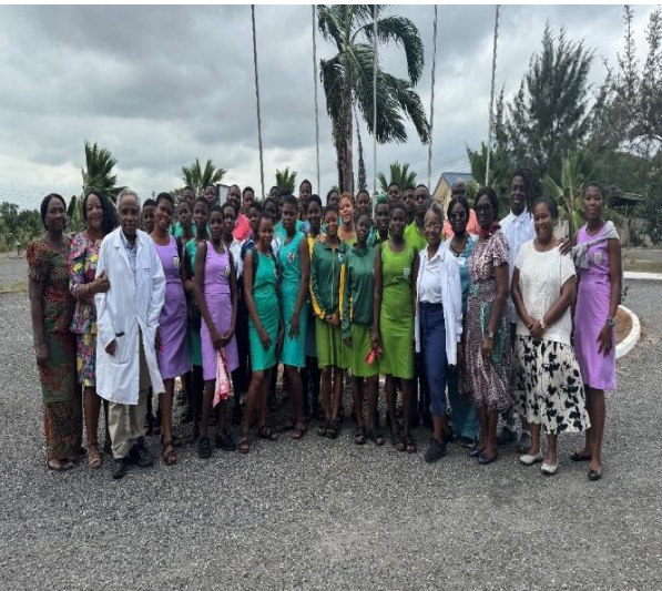
Team with student group