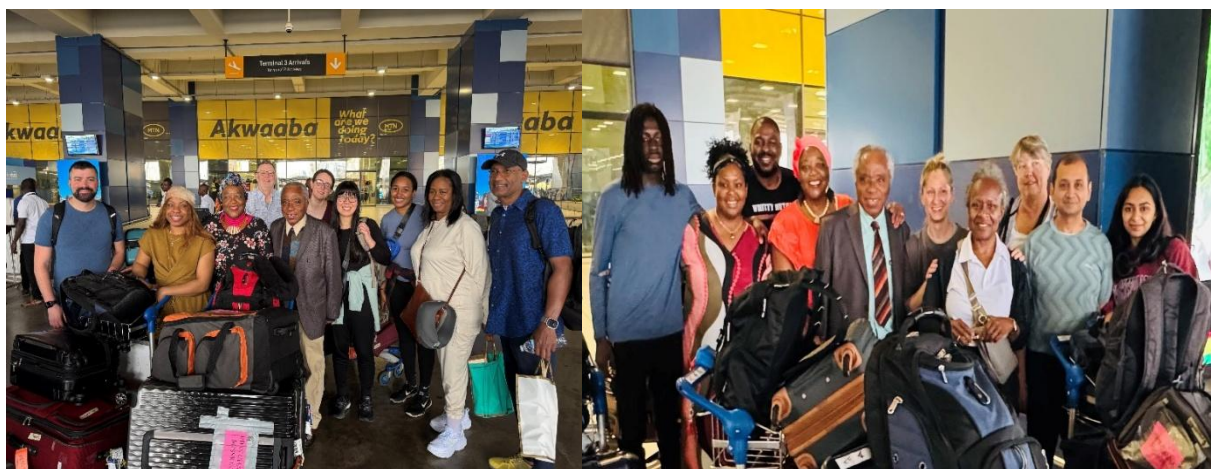
Part of Mission team January-February 2025