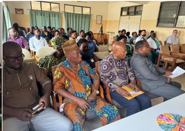
Staff meeting to discuss Morgue project