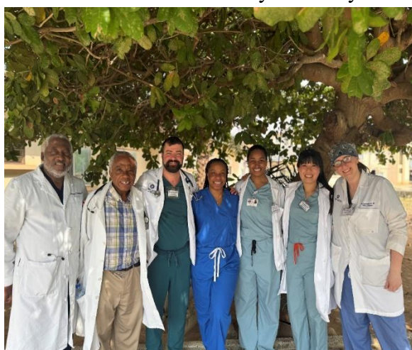
Medical & Surgical Team from US